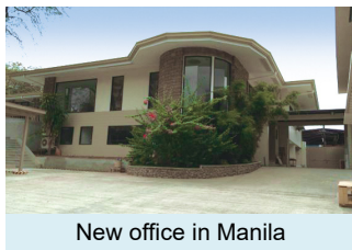
New office in Manila

MELCO Factory Automation Philippines Inc. was established in order to offer an all-round better service in the Philippines. Technical support for NCs has been offered there since January 2020. We aim to improve the satisfaction of our customers in the Philippines.