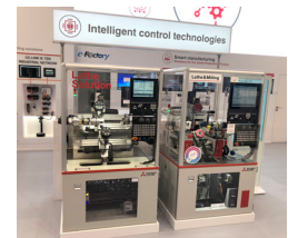
Demonstration of a solution for lathes utilizing umati connectivity

At EMO Hannover 2019, we exhibited our latest lineup of CNCs and new functions for lathe solutions. We also held an exhibit on control technologies based on "umati" technology created by the German Machine Tool Builders' Association (VDW) and its respective partners.